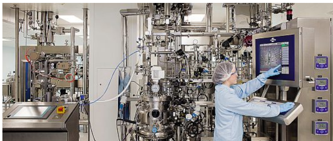
Fill-finish of therapeutic protein-based drug substances at the Irish National Institute for Bioprocessing Research & Training (NIBRT).