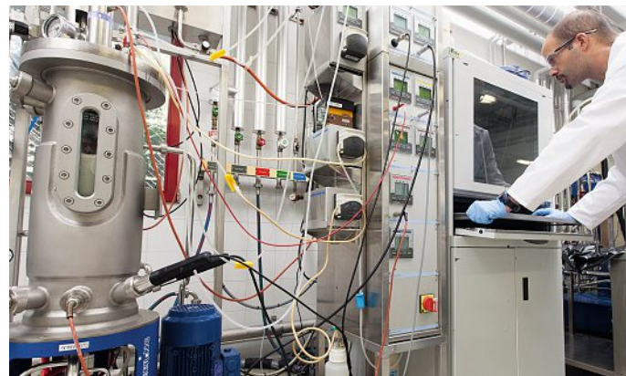
Modern process analytical technology is essential for the biosynthesis of novel generation polyhydroxyalkanoates.