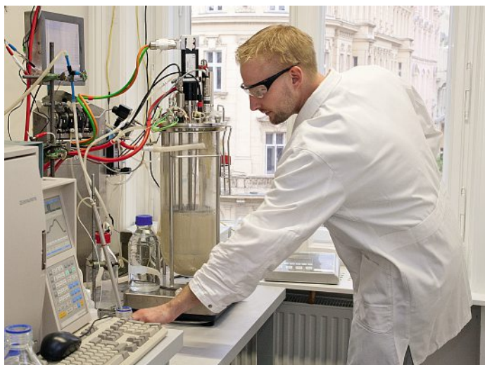
Researchers at the Institut für Verfahrenstechnik, Umwelttechnik und Technische Biowissenschaften at the Vienna University of Technology have developed a method of obtaining information much faster than before with the aid of metabolism of micro-organisms which increases productivity.