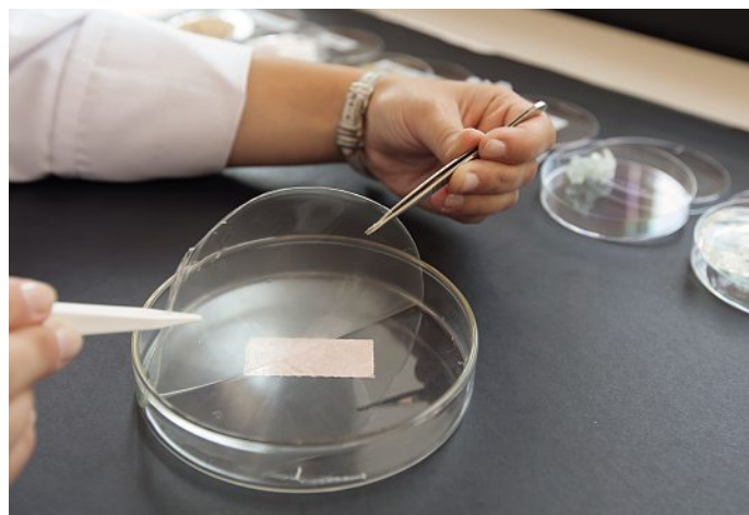
A novel generation of bacterial biopolyesters are more transparent and exhibit enhanced material properties.