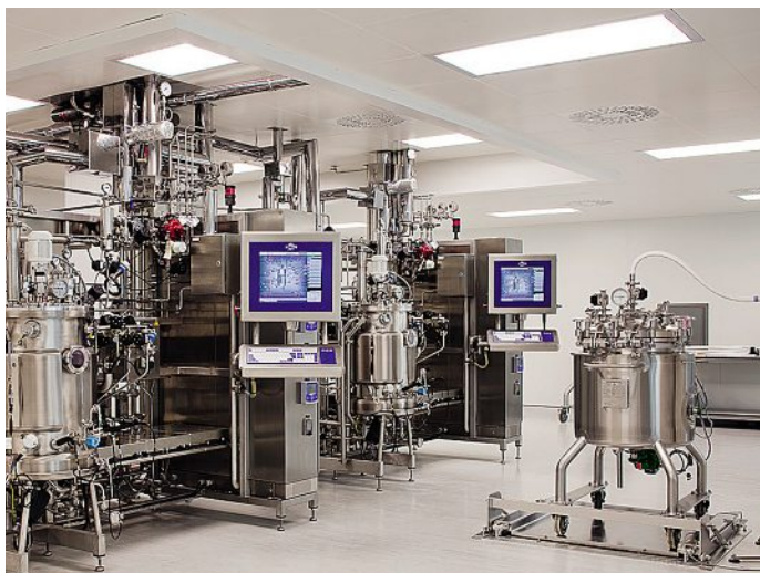
Upstream processing suite at the National Institute for Bioprocessing Research & Training (NIBRT) in Dublin, showing two completely controlled 150-litre perfusion bioreactors (left of image) and harvest vessel (on right of image).

limited to any one area – they are essentially micro-reactors with controlled properties.”