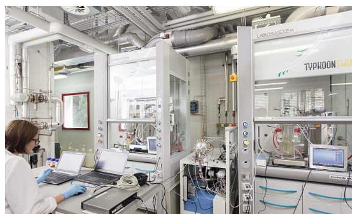
Safety first! The recently established fermentation infrastructure enables the safe handling of bioprocesses with dangerous gases (CO, CO 2 and H 2 ).

Another brainwave is to establish an integrated processing technology for the efficient synthesis of cost-effective commercial new biopolymers by fermenting Syngas generated from the pyrolysis of very complex feedstocks. “We focus on the integration of innovative physico-chemical, biochemical, downstream and synthetic technologies to produce a wide range of new biopolymers, based on a number of novel and mutually synergis-