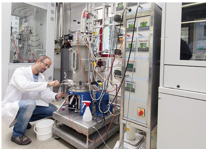
Fed-batch cultivation of Pseudomonas putida for the production of polyhydroxyalkanoates.